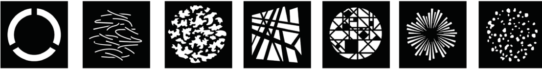
Pos. 1 Pos. 2 Pos. 3 Pos. 4 Pos. 5 Pos. 6 Pos. 7